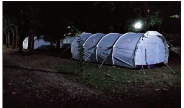
Tents purchased by NOVA provide shelter for our staff who are living outdoors.

Over three months have passed since the earthquake. There continues to be strong aftershocks in the region as well as several tropical storms. Tens of thousands of peoples' lives continue to be drastically affected by these tragic events. Thousands of people, including members of NOVA's staff, are sleeping outdoors because of destroyed or severely damaged homes. Many schools and churches have also been destroyed so these places of refuge in difficult times are also not able to shelter people. These