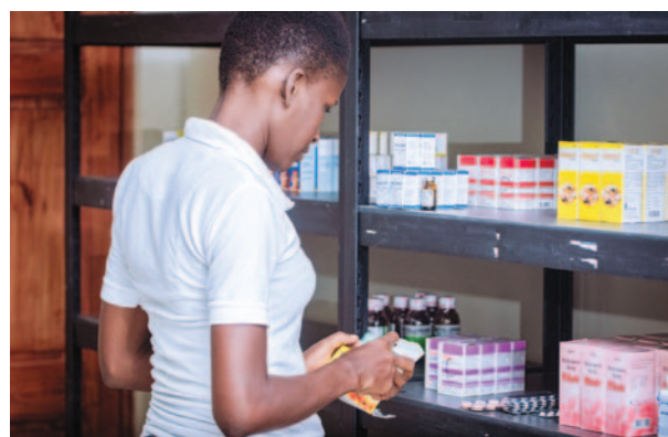
NOVA's pharmacy in 2025.

A handwritten signature in black ink, appearing to be 'Joe'.